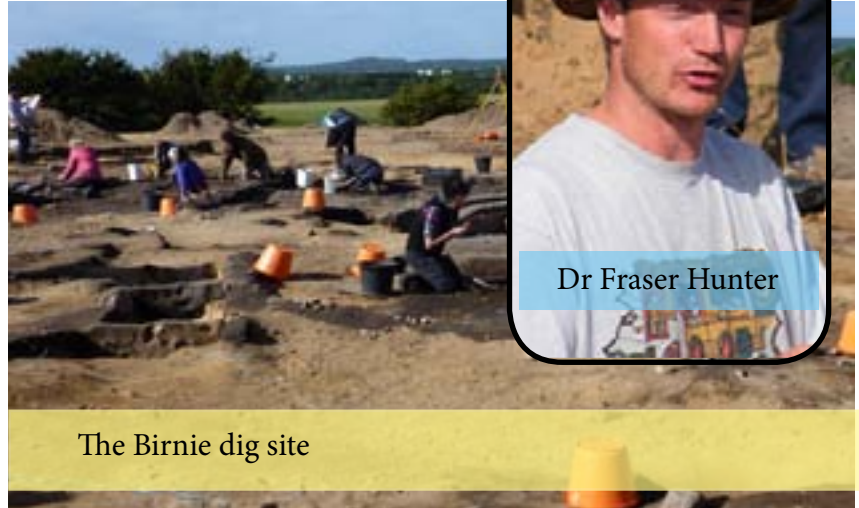
The Birnie dig site