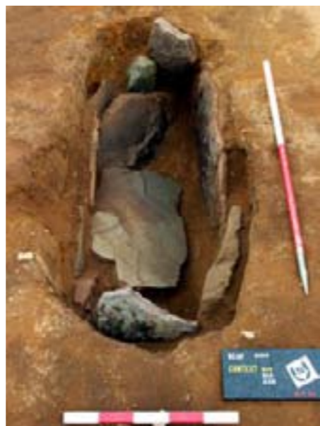
The grave at Rhynie