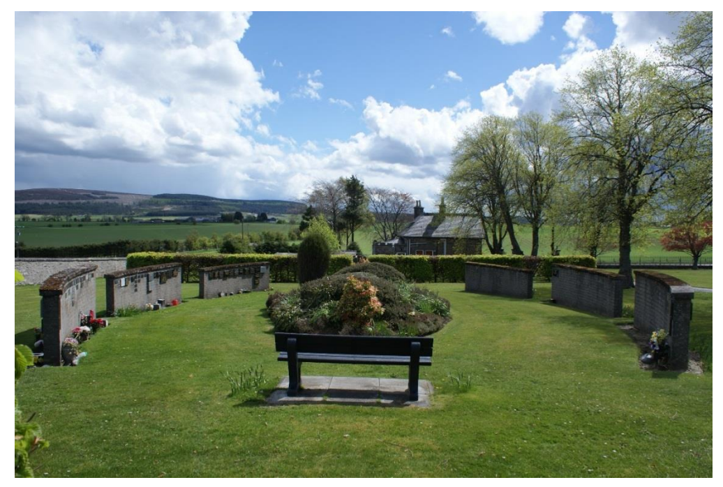
Photograph 4: Broomhill Garden of Rest, Keith (KM)