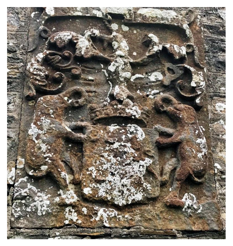
Photograph 1: The Oliphant Coat of Arms, Keith (KM)