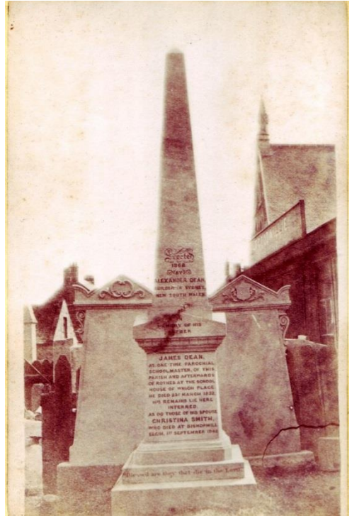
Photograph 6: 1868 Photo (LR)