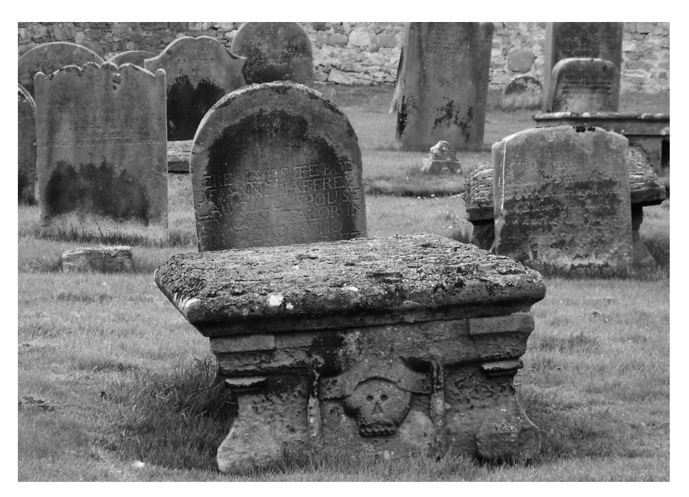
Photograph 2: Burghead Old Cemetery (SL)