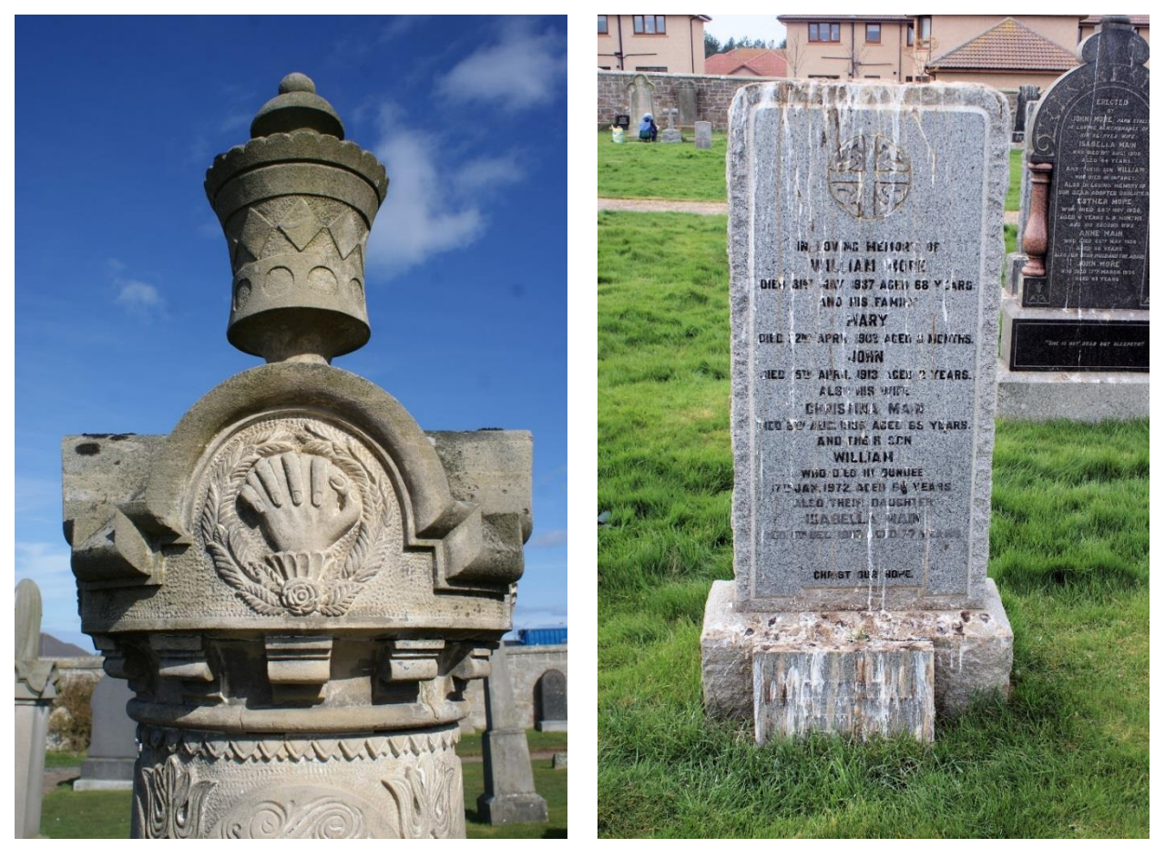
Photograph 8: Detail of Isabella Brown stone at Burghead (KM) Photograph 9: Cleaning to be done at Burghead! (KM)