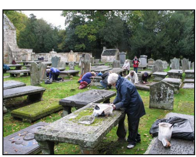
Members cleaning at St Peter's Churchyard