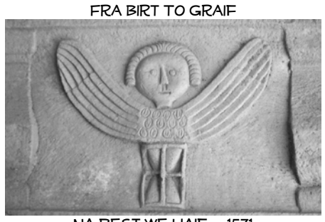
NA REST WE HAIF - 1571