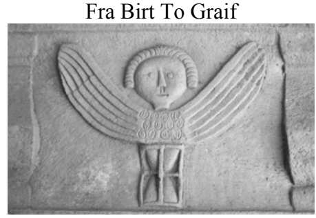
Na Rest We Haif - 1571