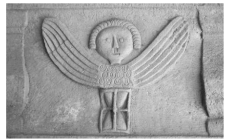
Na Rest We Haif - 1571