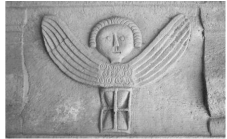
Na Rest We Haif - 1571