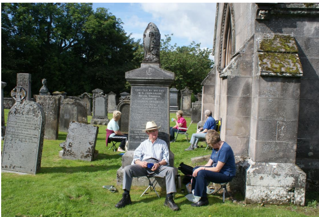
Lunch time at Aberlour Churchyard