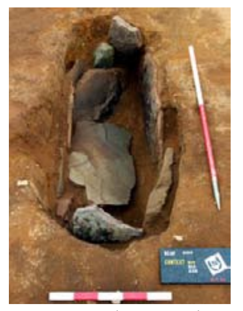
The grave at Rhynie