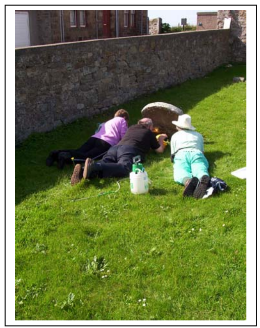
Burghead Cemetery on a Sunday morning. Perhaps you can provide a better caption!

Sunday, 5th September saw our group's first visit to this graveyard. Contrary to expectations, the weather was exceedingly kind and the turnout excellent, 12 members being present. The idea was to record all the M.I's in one visit if possible, as well as finding buried tombstones.