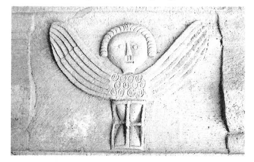
Na Rest We Haif - 1571