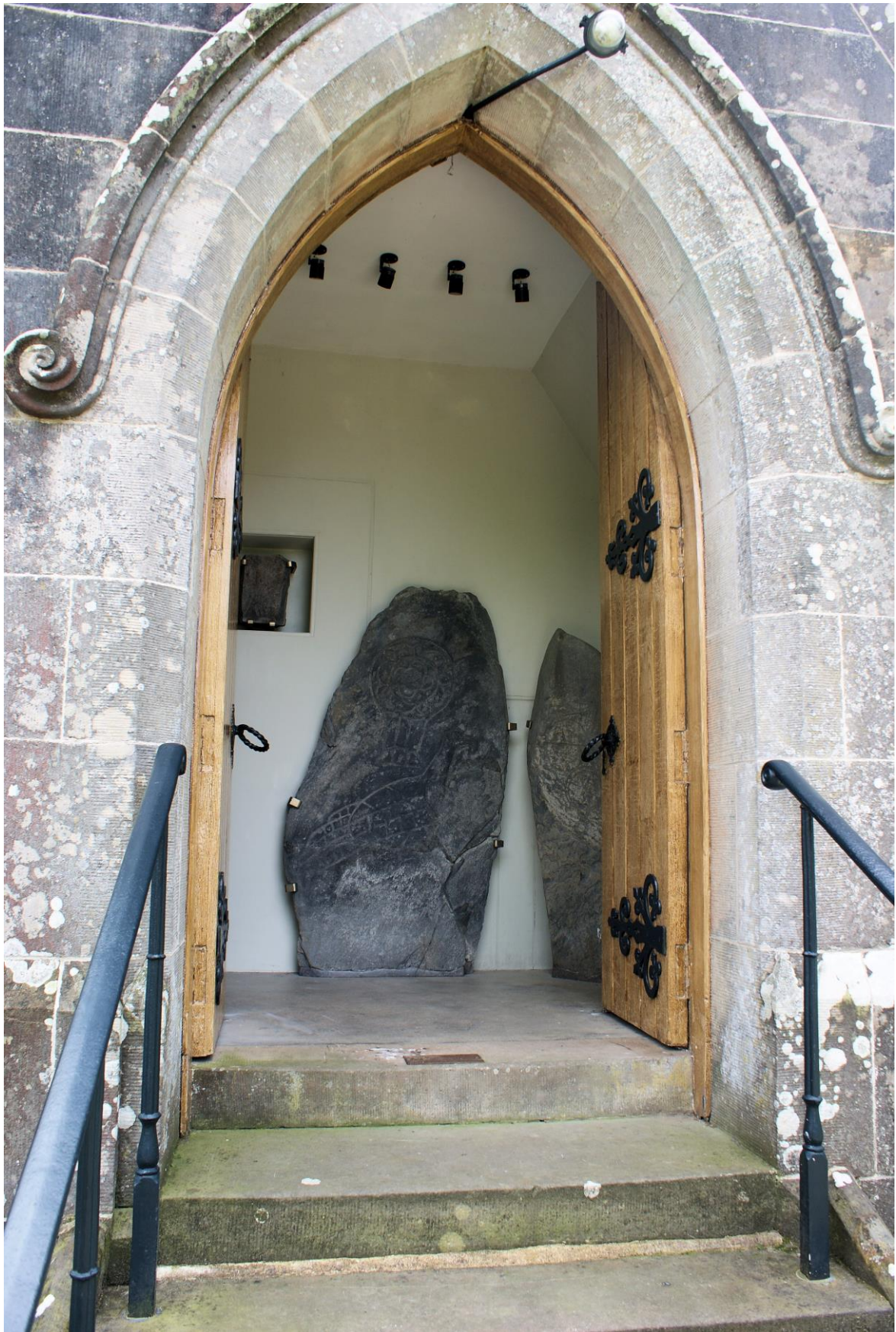
The Pictish Stones We Did Not Find!