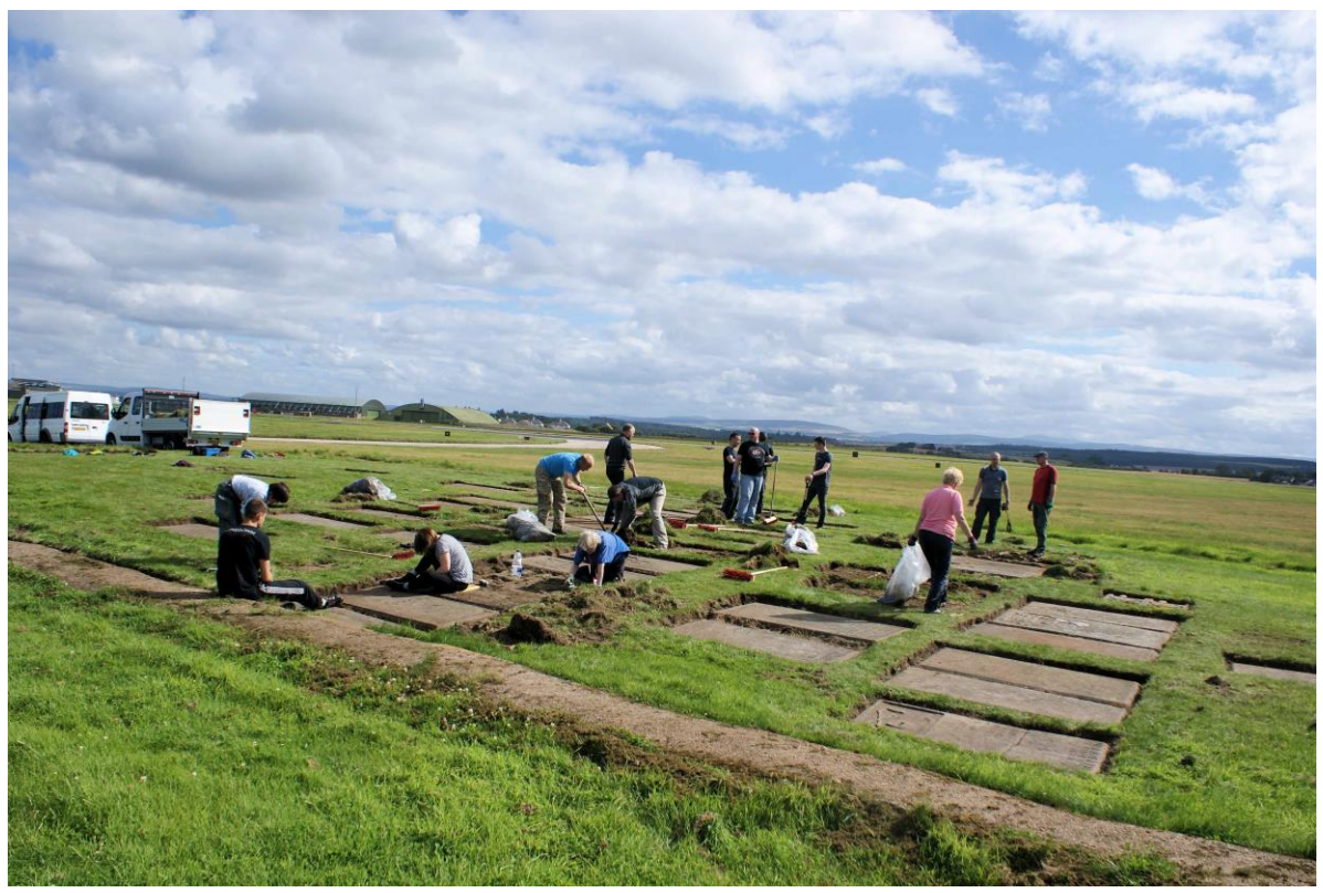
Photo KLM MBGRG help RAF Lossiemouth Volunteers to tidy up Drainie Churchyard